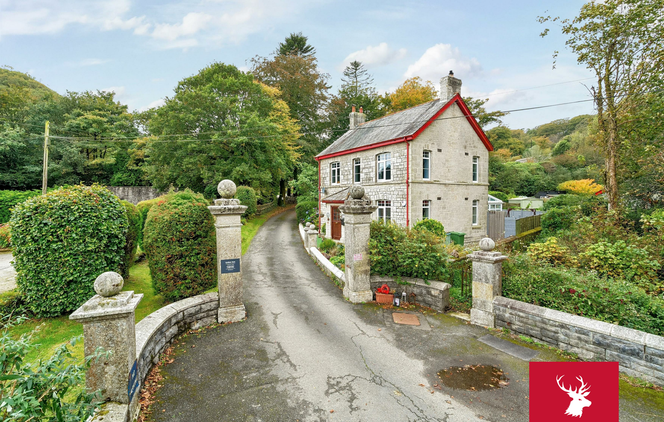
Lower Lodge, Bodmin Road